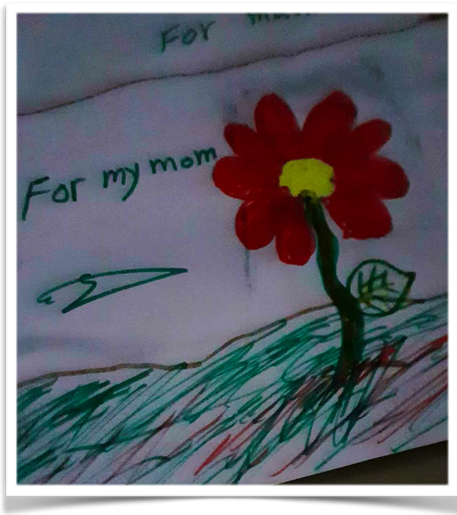
Sipel, 8 years old “ She dedicates this picture to her mom.”